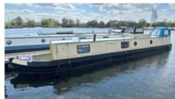
ANDICRAFT FABRICATIONS 57' 2017 | £74,950 INC VAT