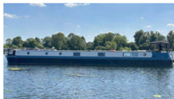
VIKING CANAL BOAT 70' X 10' 2019 | £99,950 INC VAT