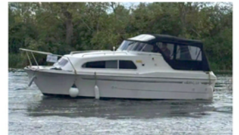
VIKING 24 HI LINE 2015 | £34,950 INC VAT