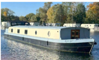
COLLINGWOOD ABODE 64' 2021 | £129,950 INC VAT