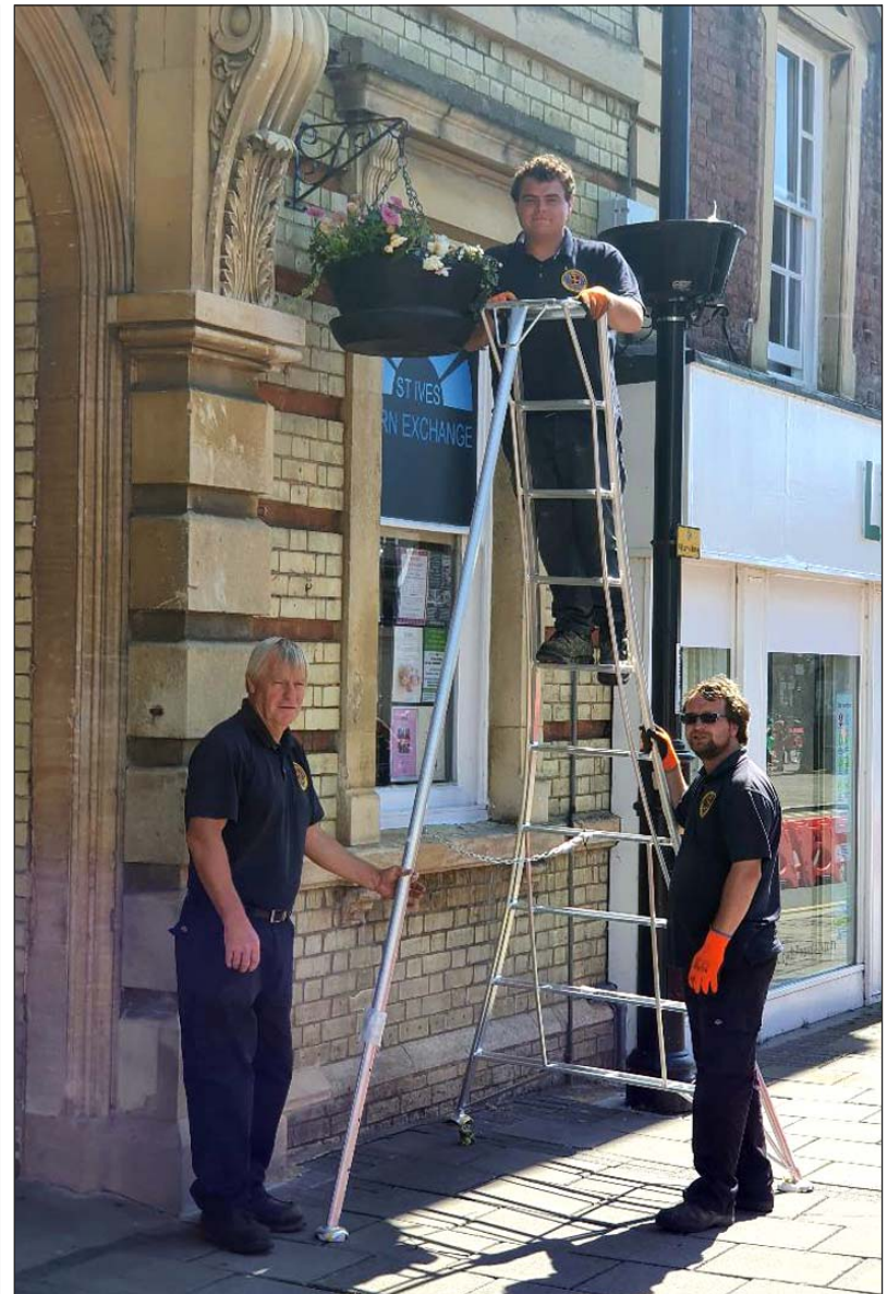
Town Council staff putting up new hanging baskets outside the Corn Exchange.