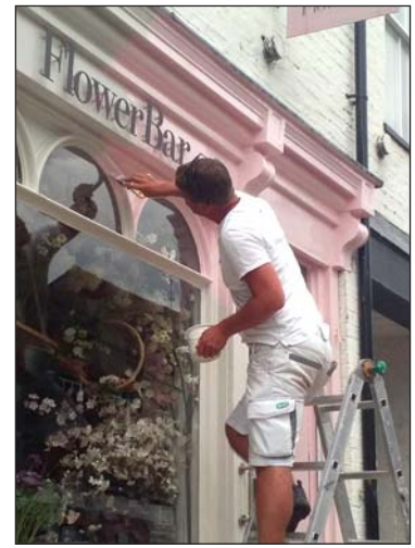
The Flower Bar getting a new lick of paint.