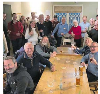
The White Swan team at Conington