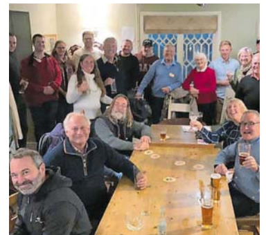
The White Swan team at Conington