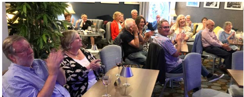
Below: The appreciative audience enjoying live music. For more details of the concerts see the article on page 4.