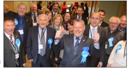
Tories celebrate Ablewhite being elected PCC in 2016.

The Cambs Times, sister paper to the Hunts Post, disclosed that a police search came across 'a small box containing various size spent and live ammunition' in a locked cabinet. This strange 'News' suddenly emerged, almost 18 months