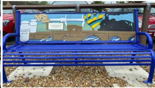
A charging point and a new bench which brightens the scene by the car park.