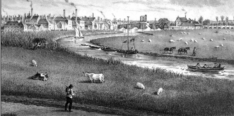
Above: St Ives from the west c1848. In the foreground is Holt Island and beyond several gangs of lighters, some with sails up moored along The Waits and up to the Bridge. The New Bridges can be seen to the right by the old Dolphin.