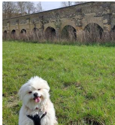
Erik pictured in front of some of the arches.