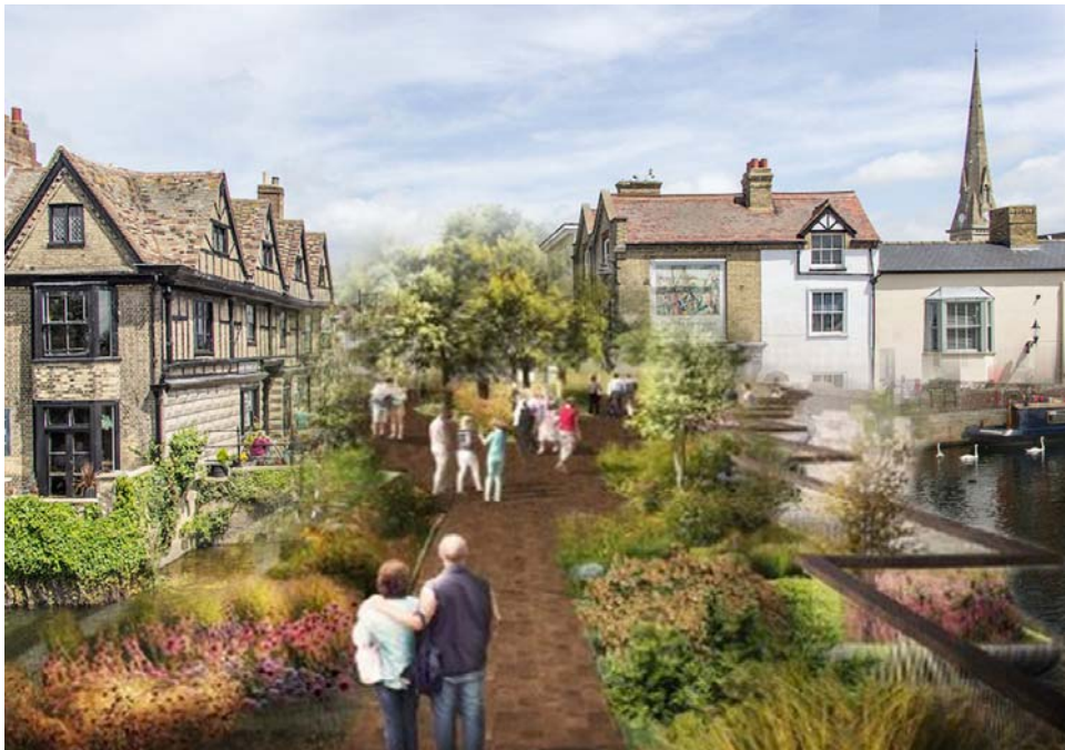
View from the Chapel – an artists impression of how the new Garden Bridge could look.

The Riverporter has been made aware in a leaked document of a recent council meeting when there was an agenda item tabled to discuss the positioning of the new 'Parklet' areas here in St Ives.