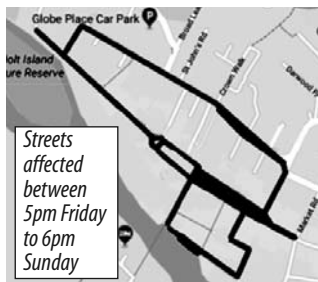
Where would the buses go?

This failed to happen last year and many of the safety measures were not followed. Rumours emerged as to why the Festival left town, ranging from the