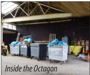
Inside the Octagon

https://www.facebook.com/pages/category/Newspaper/The-Riverporter-521574161945805