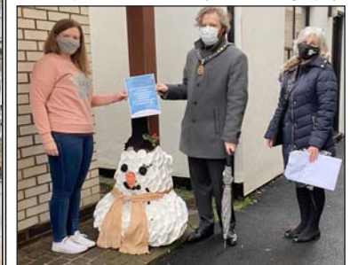
and third place to The Courtyard.