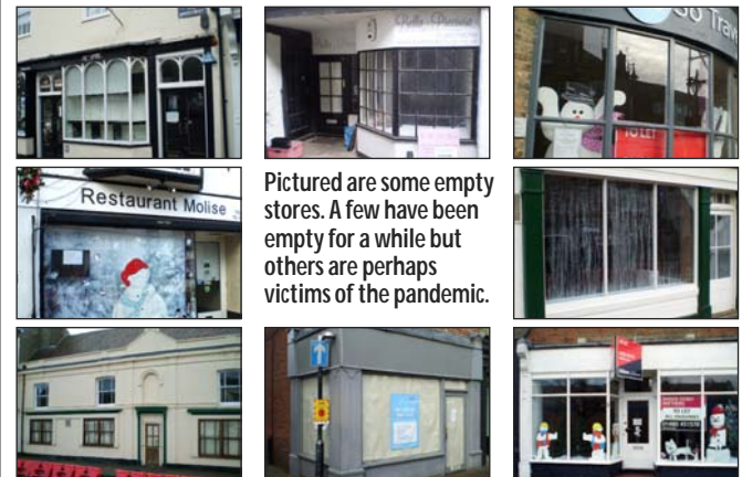
Pictured are some empty stores. A few have been empty for a while but others are perhaps victims of the pandemic.