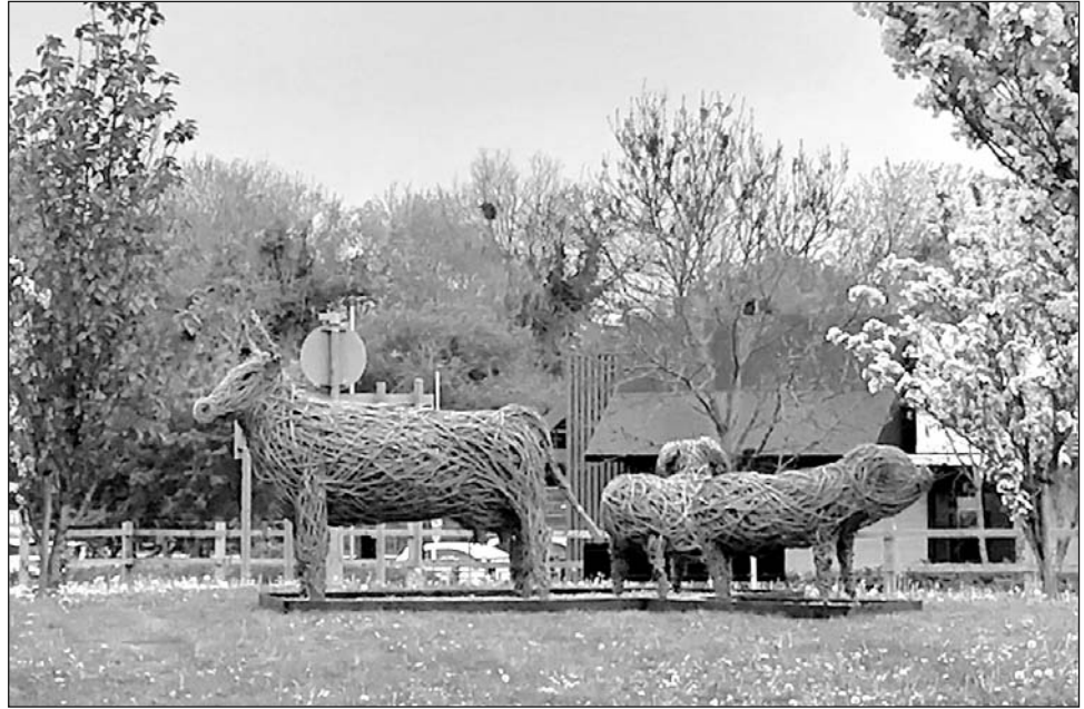
A two year project organised by St Ives Town Team came to fruition on Tuesday when three life-size willow animals were installed on the roundabout near Morrisons. See article on page 2.