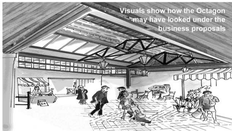
Visuals show how the Octagon may have looked under the business proposals

Regular readers will know that The Riverporter has been featuring the Octagon in its 'REASONS TO BE SHUT' series of cartoons. Residents concern about why this significant building is not being used other than to store bins, prompted the editor to raise the issue with readers in this light-hearted way. What The Riverporter has discovered is that plans, submitted to HDC over a year ago to use the Octagon as an auction room as part of a scheme to create one of the largest antiques centres in the area, have been rebuffed, despite their obvious benefit to the town.