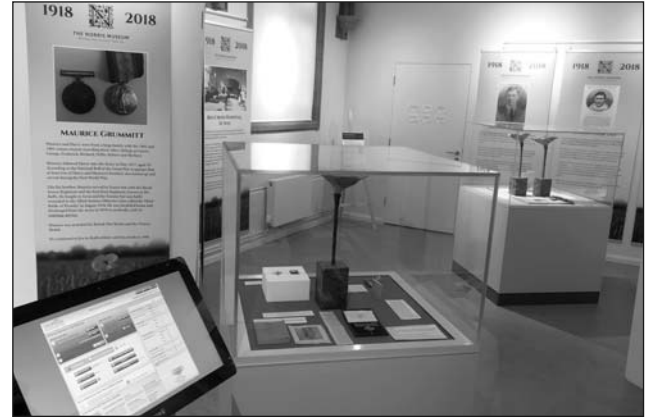
The 1918-2018 Huntingdonshire Remembers exhibition at The Norris Museum.