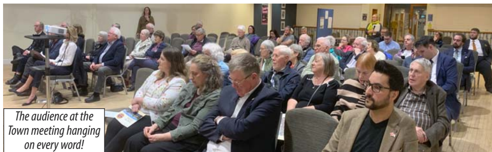
The audience at the Town meeting hanging on every word!