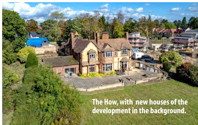
The How, with new houses of the development in the background.

Administrators are making no comment on the current status.