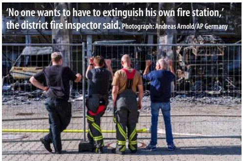
'No one wants to have to extinguish his own fire station,' the district fire inspector said.

St Ives Twin Town of Stadtallendorf, Germany hit the news as its fire station was destroyed by fire. Its state-of-the-art fire station, completed last year at a cost of tens of millions of euros was destroyed by a fire that had started in a vehicle. Members of the local volunteer fire brigade battled the blaze, as 10-metre flames leapt from the station's roof. No one was injured although 10 fire engines were destroyed. Relief at the lack of casualties quickly gave way to incredulity that the building had no fire alarm as it was classified simply as a building holding equipment.