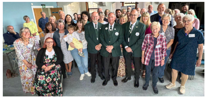
The judges with many of the volunteers from St Ives in Bloom.