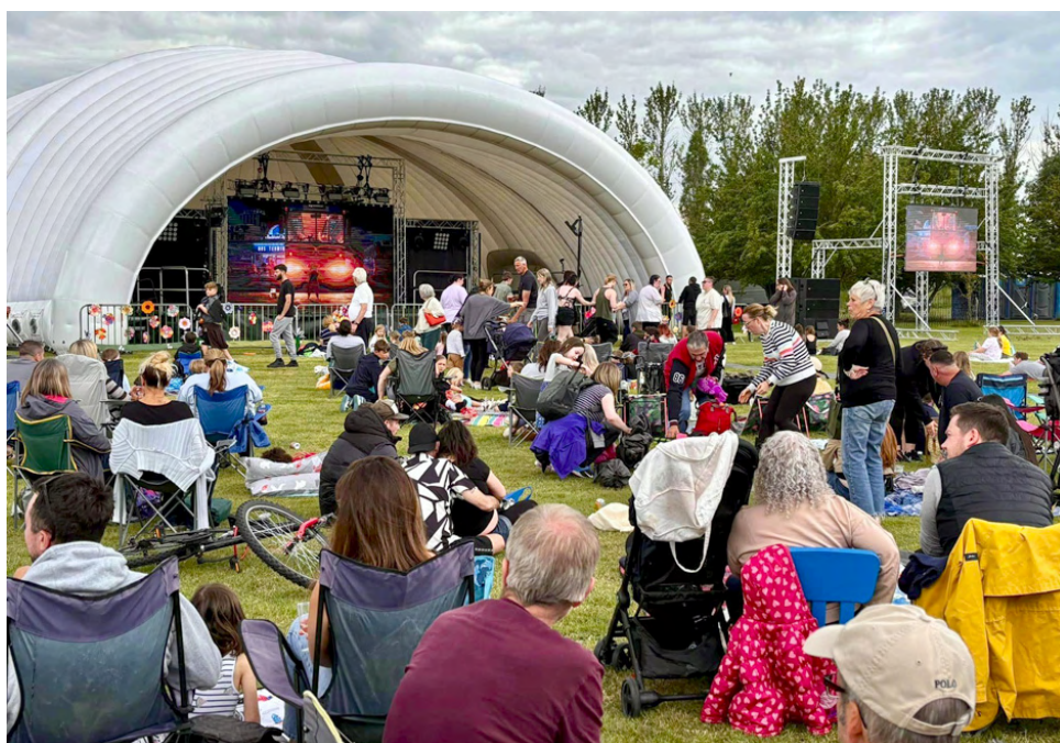
Above: Some of the audience enjoying the music at this year's Carnival & Music Festival at Hill Rise Park.

Read on-line at www.theriverporter.uk or see our Facebook page. Email: editor@theriverporter.uk