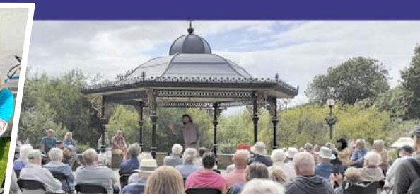
Left: Some of the FES team, organisers of Picnic in the Park and Music on The Waits.