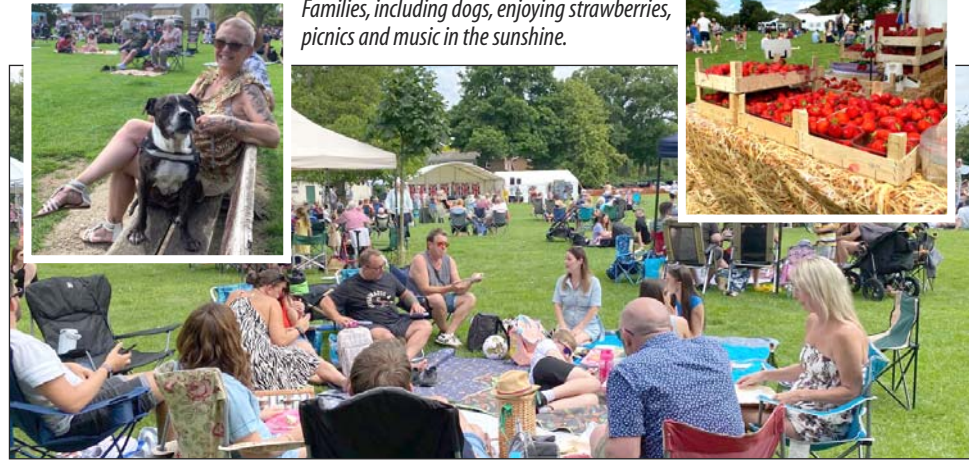
Families, including dogs, enjoying strawberries, picnics and music in the sunshine.

Last month's Picnic in the Park saw the biggest crowd ever in the 9 years the Festival has been held according to FES'the organisers. They came to Warner's Park to enjoy the sunshine, music, children's activities and locally grown strawberries and cream. Next year's, the 10th, is likely to be even better, although it is a bit too early to say if the sun will shine.