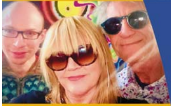
The Musical Amigos