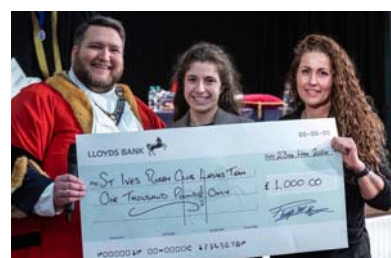
St Ives Rugby Club Ladies Team