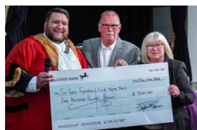
St Ives Football Club Youth Teams