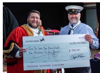
Second St Ives Sea Scout Group