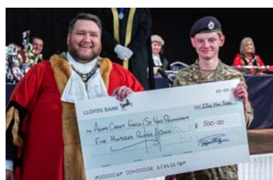
Army Cadet Force