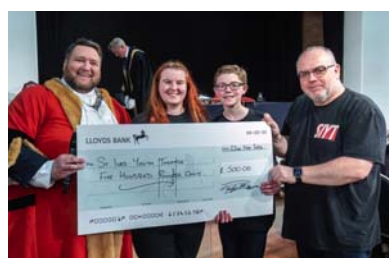
St Ives Youth Theatre