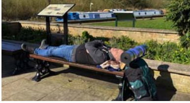
Woof! Luka That