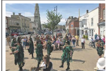
Dancing in the Old Riverport