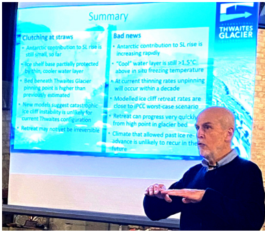
Pretty scary stuff but a rare opportunity to hear the science from someone who helped gather the data. Well done Civic Soc. Luka

The Future of the West Antarctic Ice Sheet Excellent speaker, a packed house, riveting subject. A mass of science, graphs and tables, but a clear message.