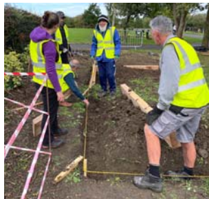
The Build Team spend a day levelling the earth and putting in raised beds.

The Royal Horticultural Society has provided a 'Connected Communities' grant to St Ives in Bloom which, with help from the Islamic community, has enabled the design and construction of a new contemplative garden near the Muslim grave area, a place for all visitors to the cemetery to sit quietly in nature.