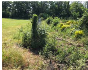
The overgrown area back in June.