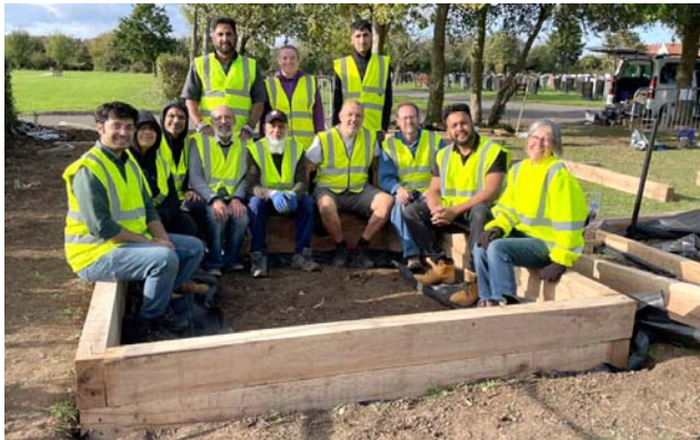
The raised beds are now built and filled, giving time for the soil to settle before planting day.

Get in touch on siibinfo@gmail.com for more details.