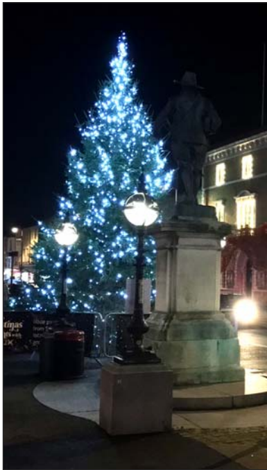
Last years town centre tree.

Following an article in last weeks Cambridge News, suggesting Christmas could be cancelled in St Ives due to the lack of funds raised, we can now announce that St Ives will truly sparkle this Christmas due to the generosity of its people and local businesses.