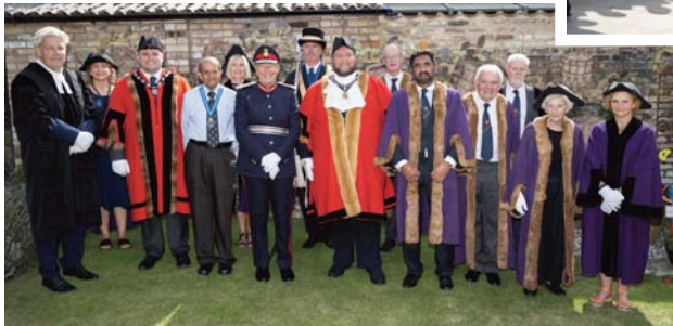
Below: The Lord Lieutenant and civic party, that endured the heat in full robes, in the Norris Museum garden prior to the ceremony.