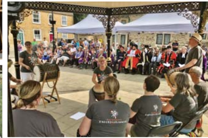
Left: Over Community