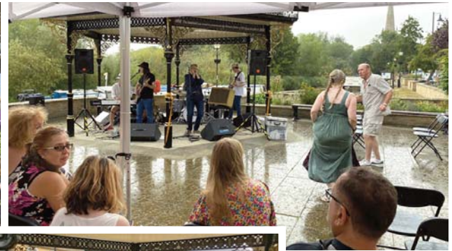
Above: Split Whiskers played on while some of the audience danced in the rain.