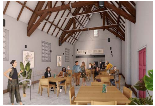
Artists impression of 3 Station Road, previously Pet Zone, which closed in 2022.