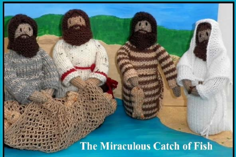
The Miraculous Catch of Fish

Open 2pm to 4pm each day apart from Saturday 16th, when open 10am to Noon.