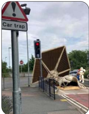
As appeared in issue RP120