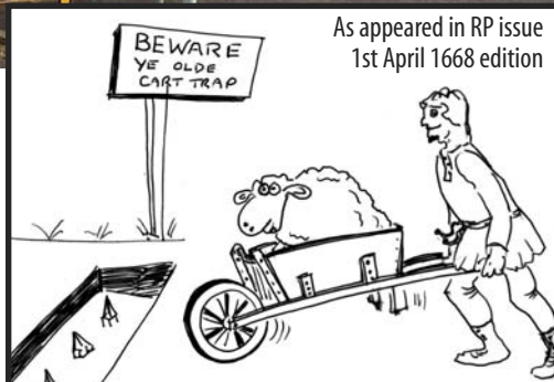
As appeared in RP issue 1st April 1668 edition

Last October The Riverporter suggested that this now infamous attraction might make the Council some money (see below right). We hope it doesn't cost them money instead.