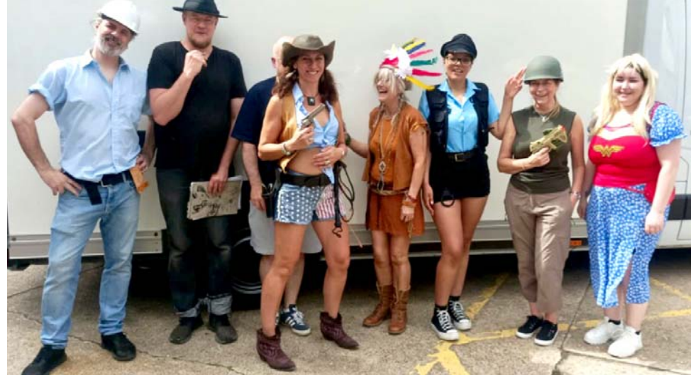
Staff at YMCA dressed 'appropriately' as the Village people on their last day.