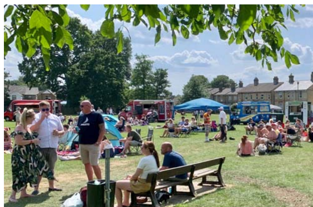
Some of the crowd that enjoyed Picnic In The Park on 25th June, one of the hottest days this summer.