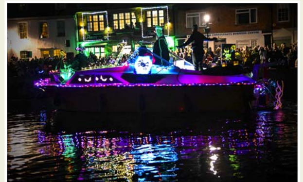
Saturday 14th - The Illuminated Boat Parade. Another Free event to enjoy from The Town Team and FES. Watch the 'parade' of boats illuminate the river with a theme of 'Musicals'. Picture from 2021 Festival.

We did thank Ian for reading The Riverporter but pointed out that over 10 bands were performing live over the following week, ranging from solo singers to full orchestras.