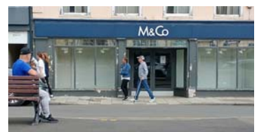
This shop needs attention but sadly remains empty.

HDC has launched a new scheme which provides grants of up to £10,000 to local businesses in Huntingdon and St Ives town centres, something we briefly mention in our last issue. The scheme, funded by the Cambridgeshire & Peterborough Combined Authority and is being delivered jointly by BID Huntingdon First and HDC.