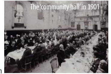
The 'community hall' in 1901

The Covid period saw St Ives Corn Exchange effectively mothballed, but once re-opened our lovely venue has flourished into a superb and lively community hub full of events, music and comedy. The comfortable new Riverport café bar has become a regular meeting place for hundreds of people each week and our 'Ticket source' phone line has never been busier.