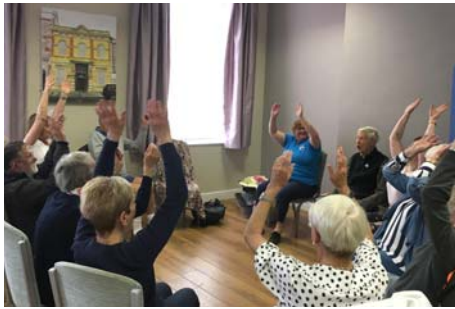
Below: The Love to Move demonstration in full swing.

He also led a rousing finale to the day by joining a demonstration from the Memory Lane Singing Cafe.