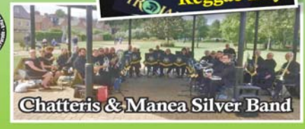
Chatteris & Manca Silver Band