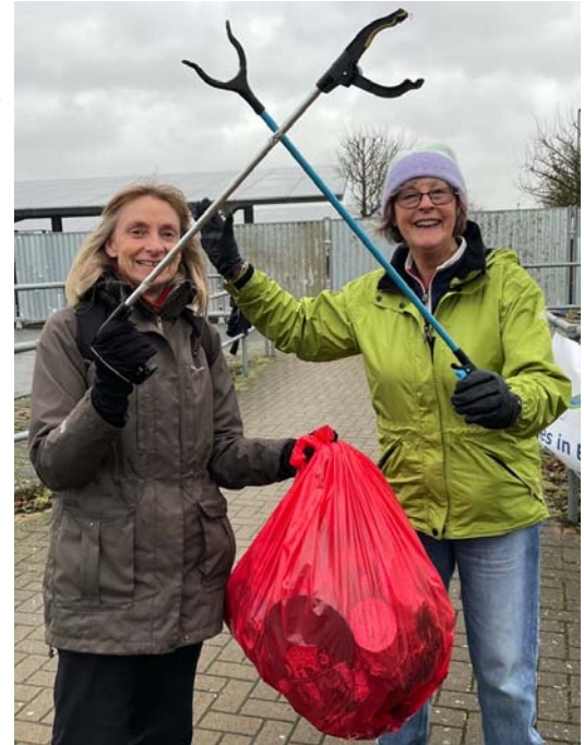
Two of the 30 enthusiastic volunteers. Comments from those new to litter picking included, 'We really enjoyed our first litter pick!'

In just one hour, 30 volunteers collected 27 bags for landfill and four bags of clean recycling, which included beer and soft drink cans and bottles. The 50 metre stretch of Meadow Lane revealed the following pickings: a microwave, toilet, a pair of jeans, a sleeping bag and a variety of detritus that you might imagine would be left by lorry drivers parking up. The new refuse sack hoops that were bought with a grant from the Town Council were a winner, and on such a windy day definitely made it easier to pick up litter. If you would like to help to keep our town litter free, you can join one of the regular picks organised by St Ives in Bloom, see www.stivesinbloom.co.uk