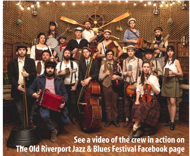
See a video of the crew in action on The Old Riverport Jazz & Blues Festival Facebook page

Tickets are available at www.ticketsource.co.uk/eventsstives and from the Riverport Café Bar.