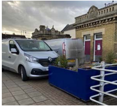
Parklets prevent parking?

Metro Dynamics was paid £50,000 to produce the Masterplan and according to Meristem, the company supplying the parklets, they each cost £10,000 per unit.