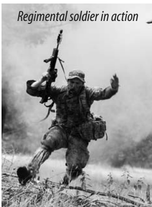
Regimental soldier in action